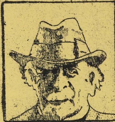
LLOYD GEORGE: ACQUIRED SHARES IN MARCONI