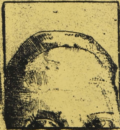
BONBR LAW: RECEIVED £10,000 A YEAR FROM BEAVERBROOK