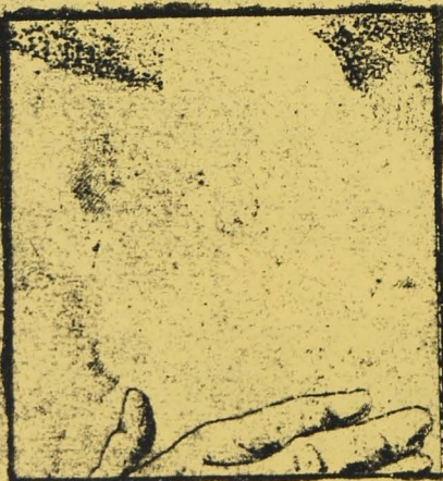
PRESS LORDS FAVOURITE: INVEST MONEY IN RISING SHARES