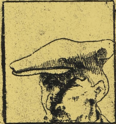
RAMSEY MACDONALD: ACCEPTED CAR FROM MILLIONAIRE