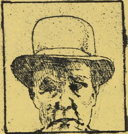
LORDS BIRKENHEAD: GIVEN £5000 TO STOP WRITING